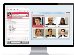
iPECS UCS Desktop Client