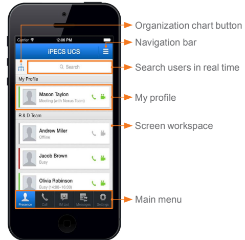
iPECS UCS Mobile Client for iOS