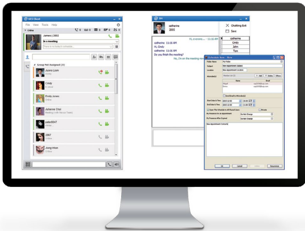
iPECS UCS Desktop Client for Windows