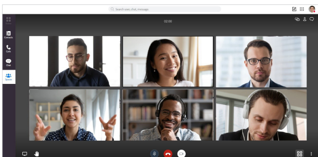
[ Video conference ]